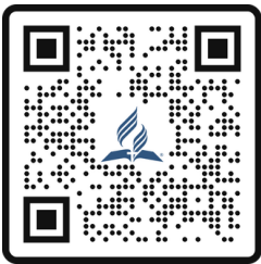
BULLETIN QR CODE

(423) 892-6013 · standifergapsda@gmail.com Clerk: churchclerk@sgsda.org