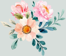
Flower Ministry: 1 st and 3 rd Thursday of the month.