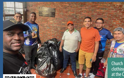
Church members stand with donated food, clothing, water, and other relief supplies collected at the Central East Venezuela Conference headquarters in Caracas. The conference is serving as a collection center to support families affected by the devastating earthquakes that struck Venezuela on June 24, 2026.

Full Article: https://interamerica.org/2026/06/adventist-leaders-assess-damage-mobilize-relief-after-venezuela-earthquake/