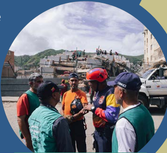
ADRA Venezuela leaders meet with Civil Protection officials in Caracas as emergency crews assess a collapsed building following the powerful earthquakes that struck Venezuela on June 24, 2026. ADRA has begun coordinating humanitarian response efforts as search-and-rescue operations continue across affected communities.

As rescue and recovery efforts continue, church leaders said they remain committed to supporting affected communities through pastoral care, humanitarian assistance, and the hope found in Christ during the difficult days ahead.