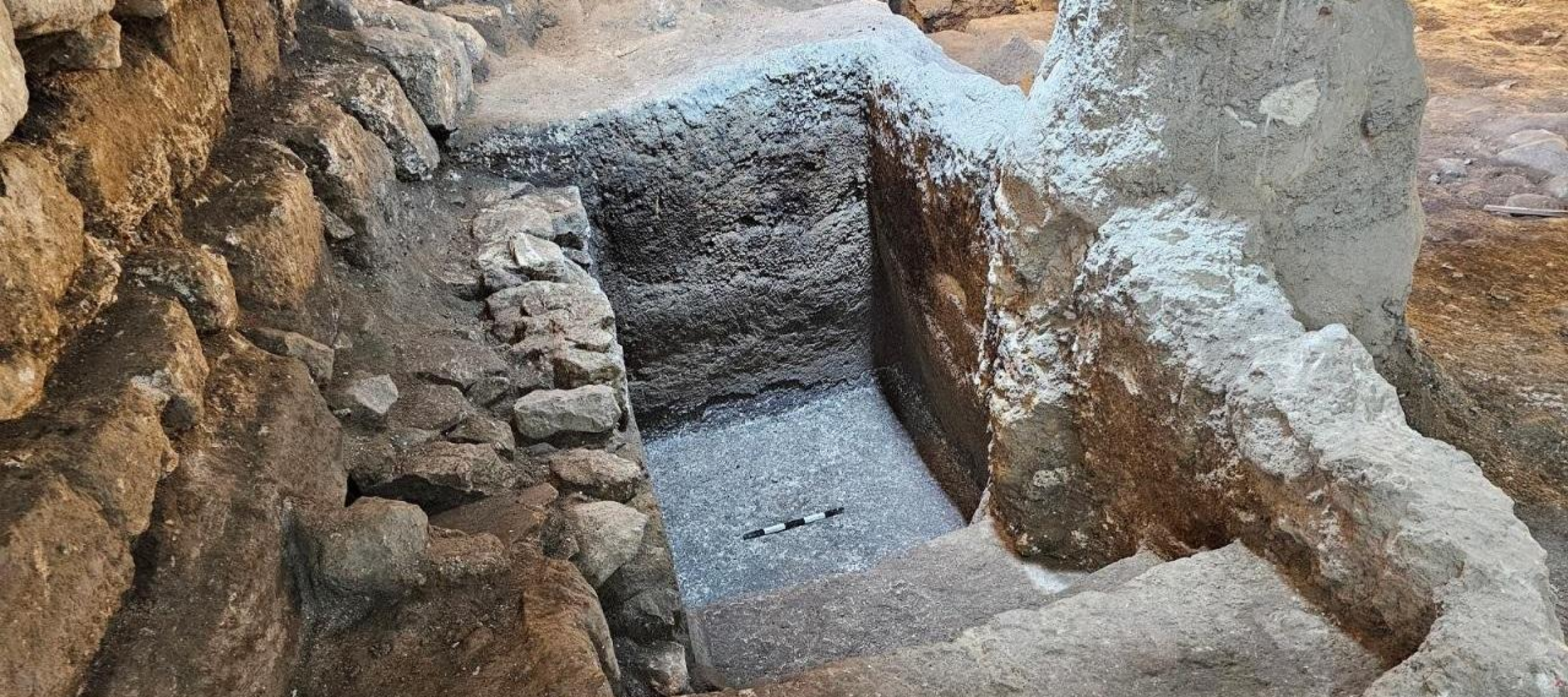
Mikva'ot: Ritual Bath