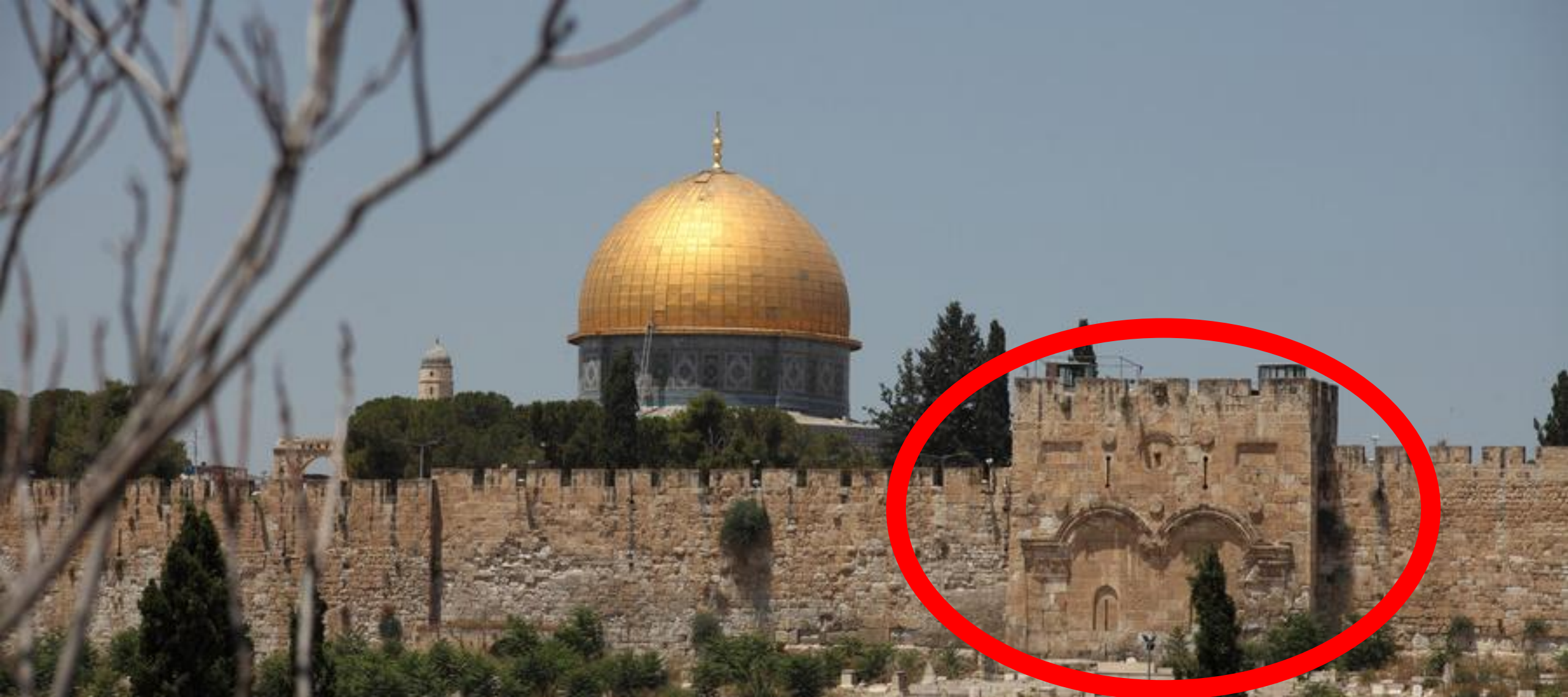
The “Golden Gate” : The Gate of Mercy