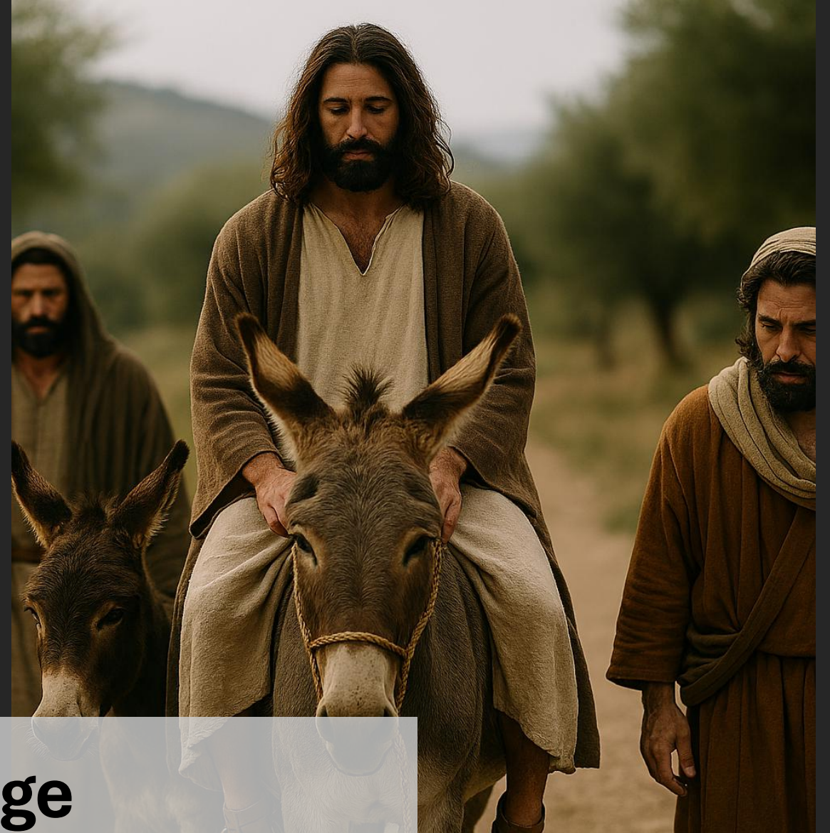
Steele of Bethphage