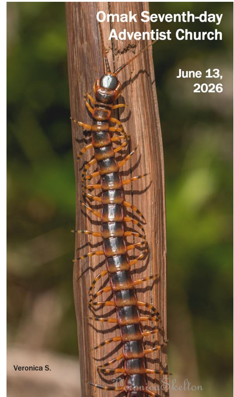
Centipede, Guyana, South America