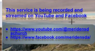
We are recording