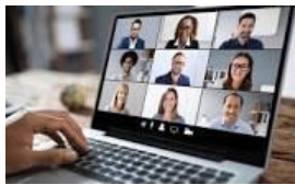
Join us on Zoom