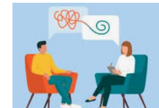
Need to talk?