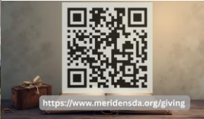
Scan for On-line Giving