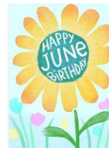
We Celebrate you!