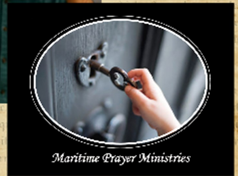
Maritime Prayer Ministries