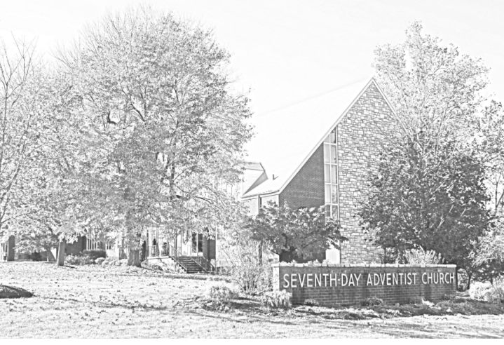
WELCOME to all who have come this Sabbath to worship God!