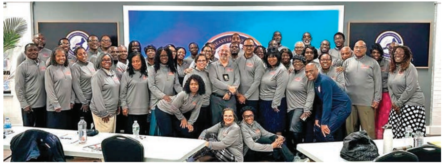
Attendees to the Lay Chaplains Training pose for a group photo at the Northeastern Conference headquarters in Jamaica, New York.