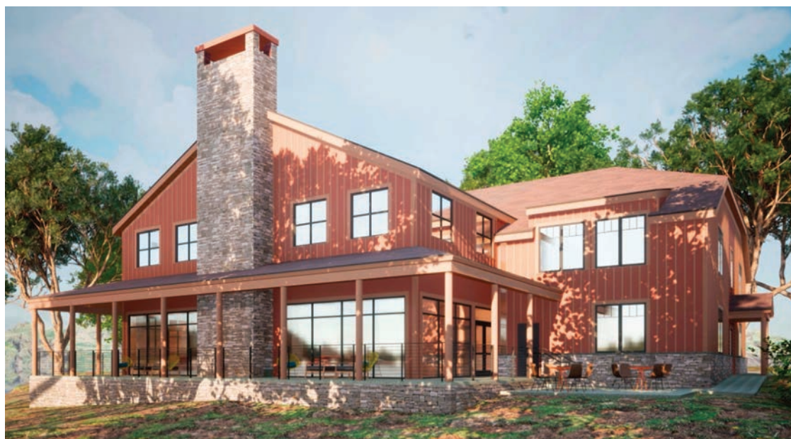
Image of proposed exterior of the new Pathfinder Lodge.

Once a cornerstone of Camp Winnekeag's ministry, the Pathfinder Lodge has faithfully served generations of youth, church groups, and conference events. Today, the aging infrastructure, with its