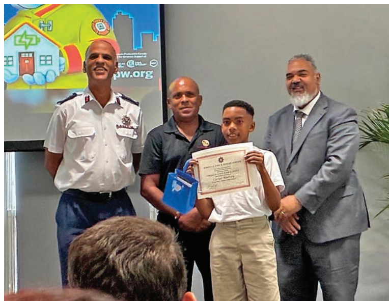
A student holds his winning certificate while posing with event sponsors.