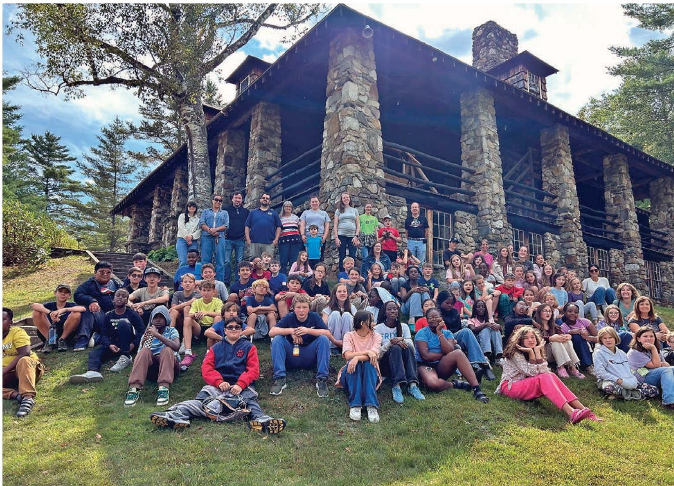
Students, parents, and teachers pose for a group photo.