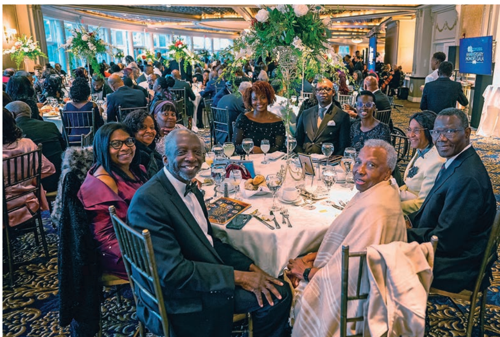
Attendees to the 80 th Anniversary Honors Gala enjoy their evening.