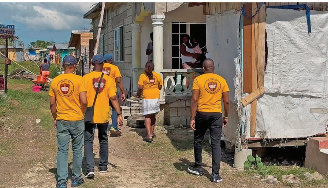
Representatives from the Greater New York Conference tour an area ravaged by Hurricane Melissa.