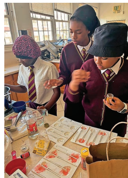
Students work together on their business project.