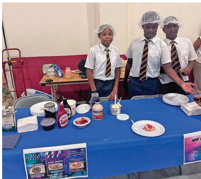
Students sell some of their products helping to raise $1,900.