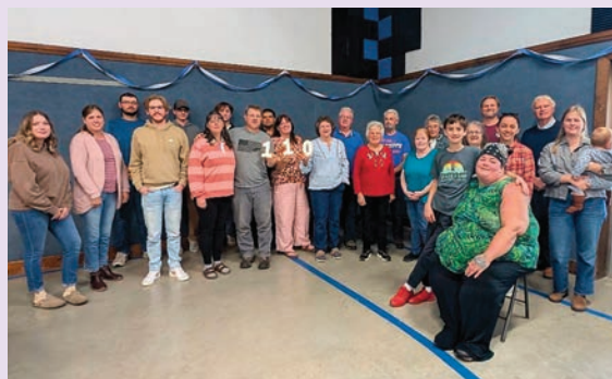
Riverview Memorial school alumni pose for a group photo to commemorate the school’s 110 th anniversary.