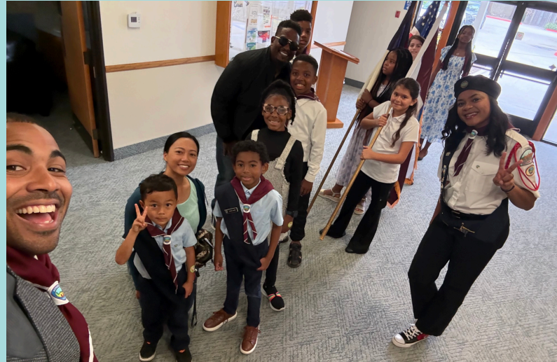
Adventurers and Pathfinders pose before the program.

As a small church family, we understand that success is not measured by numbers alone. What we may lack in numbers we make up for in heart, perseverance, and a genuine love for God and one another. We are grateful for every child, parent, staff member, and supporter